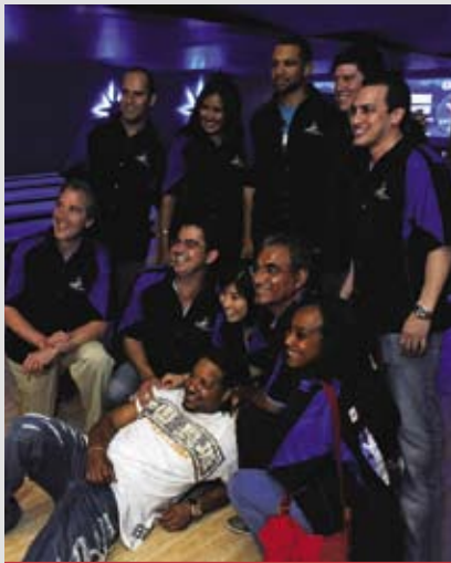
Manny Ramirez lounges with Dodger fans at the 2009 State Farm Dodgers Dream Foundation Bowling Extravaganza.