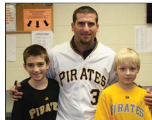
Lincoln with fans during a Caravan stop in 2011