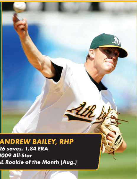
ANDREW BAILEY, RHP 26 saves, 1.84 ERA 2009 All-Star AL Rookie of the Month (Aug.)