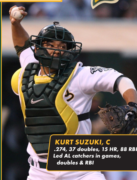
KURT SUZUKI, C .274, 37 doubles, 15 HR, 88 RBI Led AL catchers in games, doubles & RBI